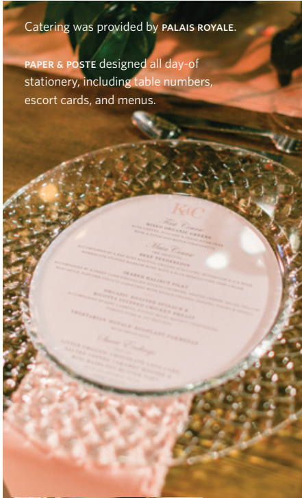
Catering was provided by PALAIS ROYALE.